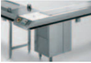
Flat belt conveyor for food distribution dimensions W x H 500 x 900 mm

Drawer with dirt scraper. Up to 12 m with 1 motor, over 12 m with 2nd motor. With height-adjustable feet +/- 15 mm. Distance between feet is 2 m. Functions: belt on/stop/proportional speed display, emergency OFF switch. Rated voltage 3N AC 400 V 50 Hz.