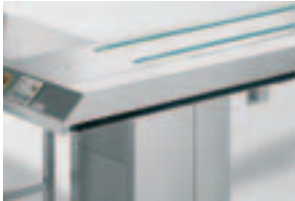
Round belt conveyor for food distribution dimensions W x H 500 x 900 mm

Conveyor carcass, round belt and motor station in modular design. Stainless steel casing, 2 round belts running with a clearance of 220 mm in sliding grooves, made of PUR with polyester draw elements, coloured green. Controls at the end of belt, switchbox with control/fuse box, main switch. Rotary current motor, stepless adjustment from 2.5 m/min – 10.5 m/min. Up to 12 m with 1 motor, over 12 m with 2nd motor. With height-adjustable feet +/- 15 mm. Distance between feet is 2 m. Functions: belt on/stop/proportional speed display, emergency STOP switch. Rated voltage 3N AC 400 V 50 Hz. For 9 m and above, an overdrive is installed to ensure smooth running of the round belts. For 12 m and above, a second drive is required.