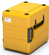
Thermoport food transport boxes