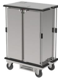
Closed tray trolleys