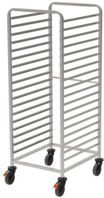
Open rack trolleys of all sizes

BGL Rieber offer an extensive range of products which are specifically designed to complement those listed in this brochure, including: