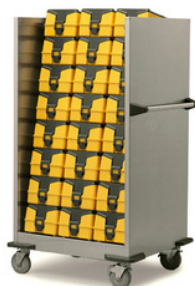
Specialist transport trolley (Rolli 10)

To find out which products are best suited to your specific feeding requirements, call 01225 704470 or email: sales@bglrieber.co.uk