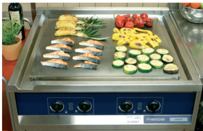
Ardox S can be used as a range or a griddle.

Metos Ardox S is a chrome-surfaced flat-top stainless steel range with a choice of two, four or six 3,5 kW heating zones. The advantage of the flat-top range over a conventional iron plate range lies in its tempered chrome surfacing which reduces heat loss, cuts the kitchen's heat generation and saves energy. You can regulate the temperature of every cooking zone separately with stepless control or just by shifting pans between the cooking zones. You can also use Ardox S as a griddle and fry directly on the surface. Height adjustable models available.