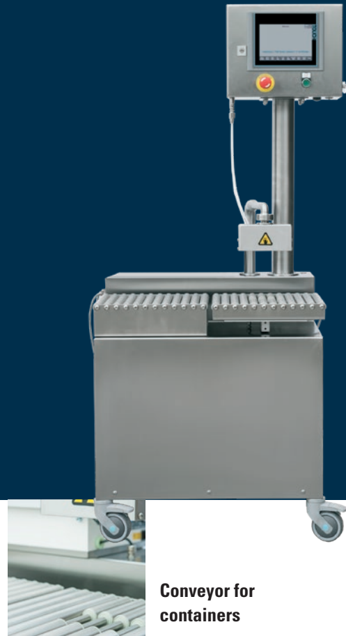
Conveyor for containers