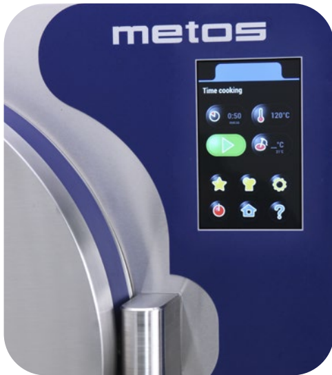
Multi-language Touch Screen interface