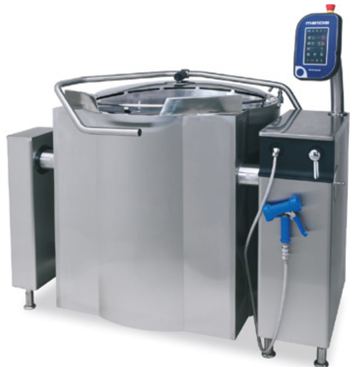
Metos Proveno 100E free standing