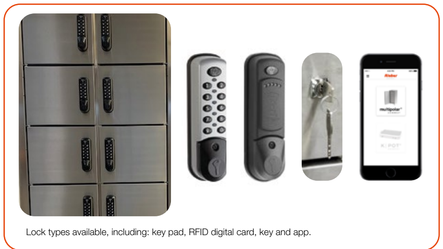
Lock types available, including: key pad, RFID digital card, key and app.