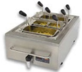
Pasta Cooker or Fryer