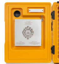
Inside of the door