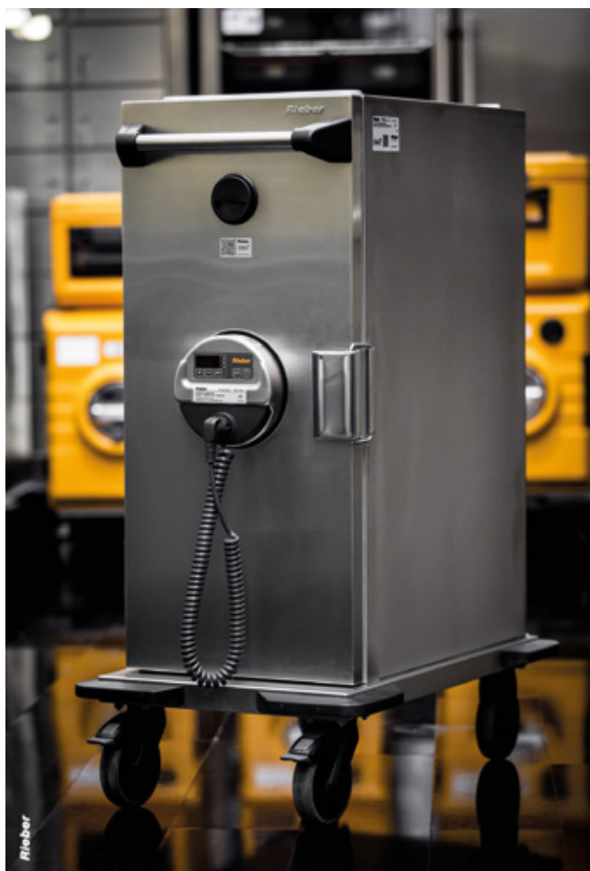
Thermoport stainless steel series