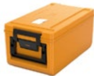
Thermoport 100 K