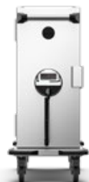
Thermoport stainless steel