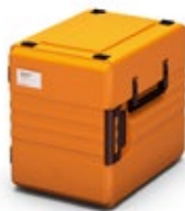
Thermoport 1000 K