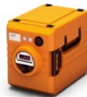
Thermoport 1000 KB