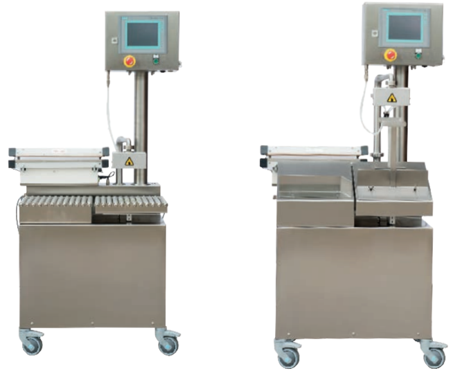
Pictured here with GN rollers Installed