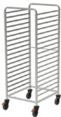
Open rack trolleys of all sizes