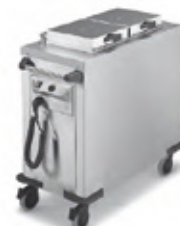
Ultra dispenser, for energy efficient heating and storage of bowls.