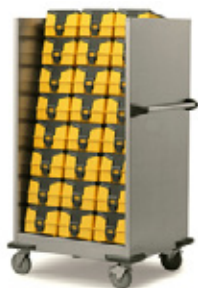
Specialist transport trolley (Rolli 10)