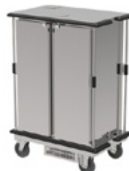
Closed tray trolleys