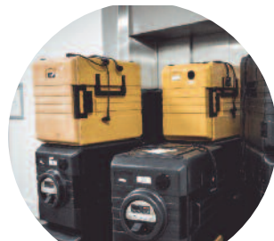
For mass catering