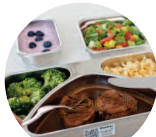
For feeding in isolation