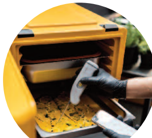
Keeping food warm