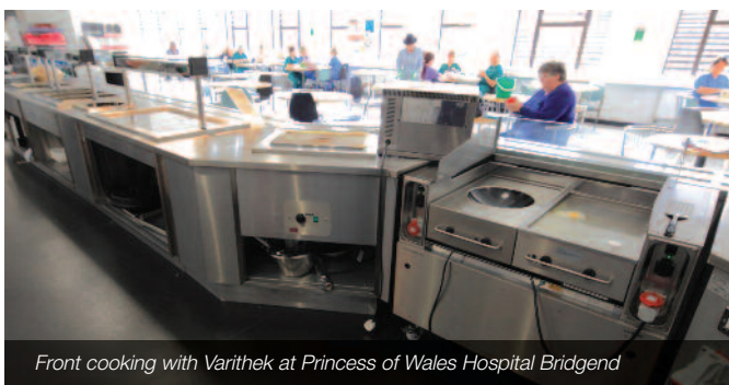
Front cooking with Varithek at Princess of Wales Hospital Bridgend

Continued Jefferies: "We wanted to improve the food offer daily by introducing themed menus and theatre cooking from breakfast to closing. The self-ventilation is a bonus because we won't need dedicated extraction."