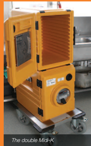
The double Midi-K

"The site occupies 600 acres, so the boxes needed to be secure, lightweight, manoeuvrable and able to cope with rough ground. The double Midi-K unit provides flexibility to allow packing of a variety of meals to cater for the varied demands of the patients, including Halal, vegetarian and special diets," explained Inox Equip Director Jeremy Walding.