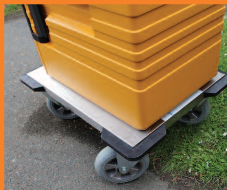
Heavy-duty castors allow users to cope with uneven or rough pathways

Available as a top or front loader, heated or unheated, the Midi-K has a combined fill volume of approximately 104 litres and the boxes are stackable and easily wheeled from the kitchen to their destination.