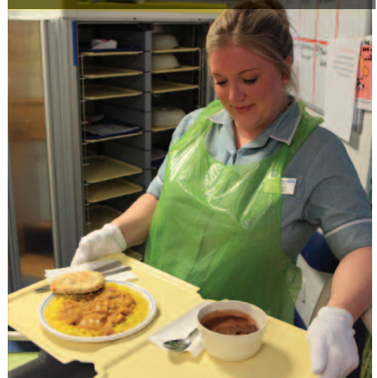
Unitray can distribute hot and cold food on a single tray

Harrogate's Catering Team have been awarded a five star 'excellent' rating in the Council's hygiene standards scheme and they have also been awarded the Soil Association Food for Life Catering Mark Bronze, recognising its push for fresh meals and good food.