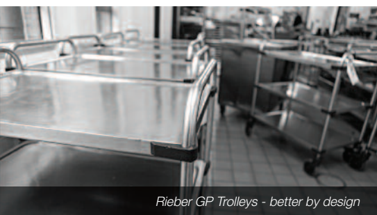
Rieber GP Trolleys - better by design

The GP trolleys feature 'intelligent screwed construction' rather than welding. This makes them tougher than normal (they don't rattle!). More importantly, they last longer in destruction tests than traditional welded trolleys.