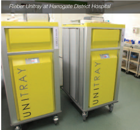
Rieber Unitray at Harrogate District Hospital

Rieber's Unitray provides the best combination of temperature control, ease of handling and it is also the best in terms