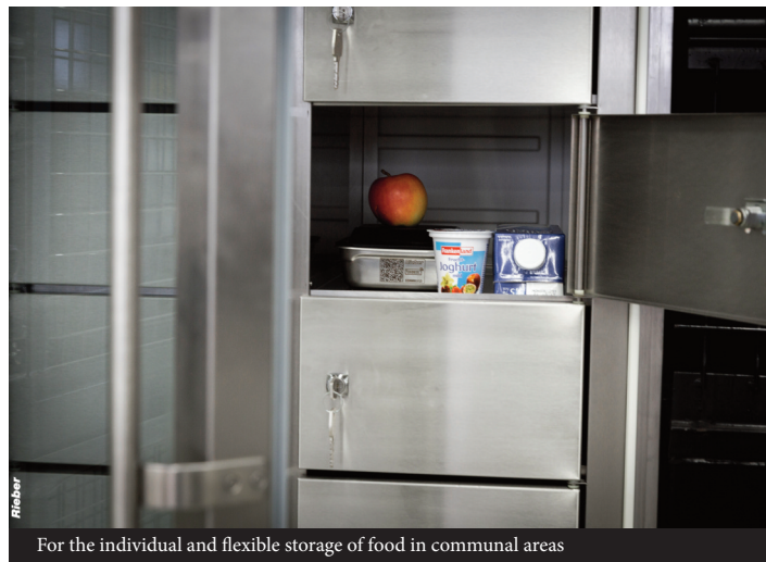
For the individual and flexible storage of food in communal areas

Rieber has the perfect refrigerator solution for situations where people live or work together – the cost-effective and energy-saving Multipolar®. Available with 4-16 individual compartments each with its own unique key, with a perfect constant temperature.