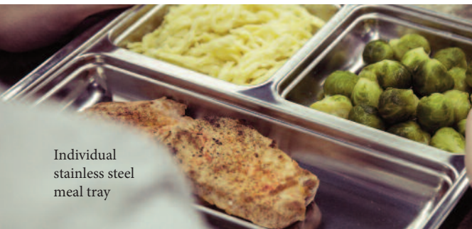
Individual stainless steel meal tray